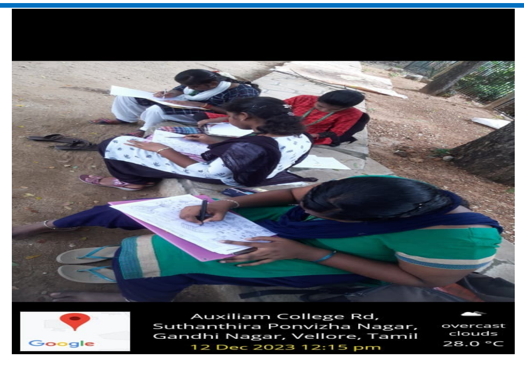
Students participating in the Pencil Art competition