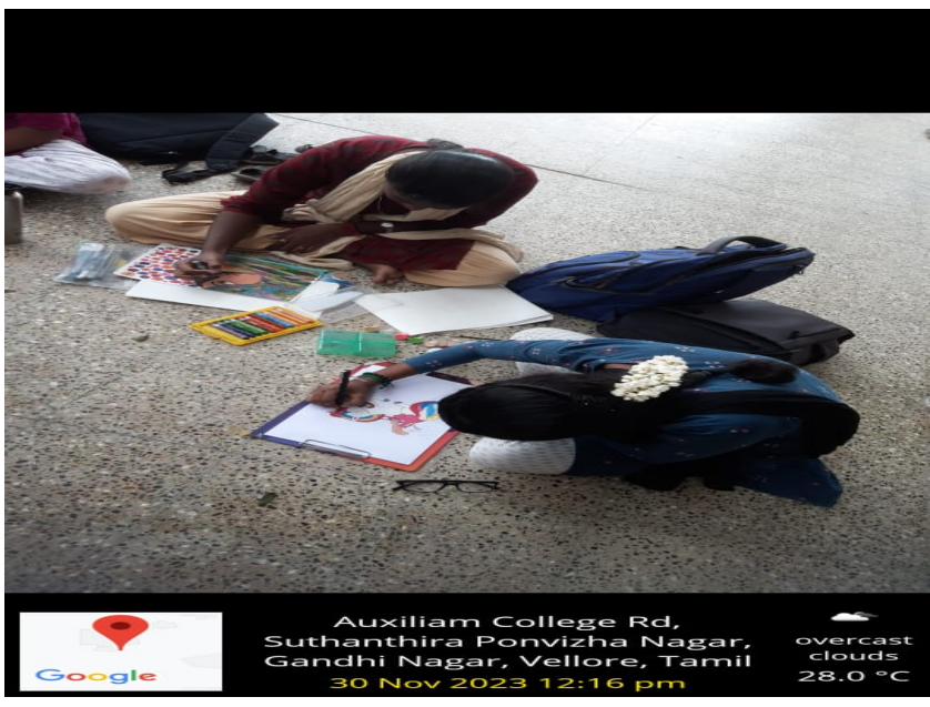
Students participating in the competition