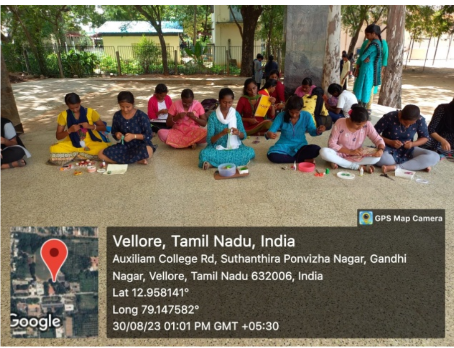
Students participating in the competition