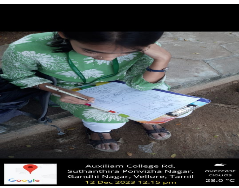
Students participating in the Pencil Art competition