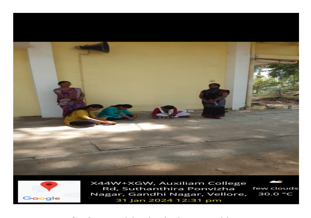
Student participating in the competition

The Health and Fine Arts club conducted the "Wealth from Waste Competition" on 31.01.2024 to inculcate the value of reusing material among students. Students from various departments actively participated and presented their work using newspaper, bottles, coconut shell, pencil, pen covers, nut shell.