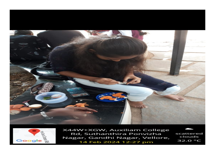
Students participating in the activity