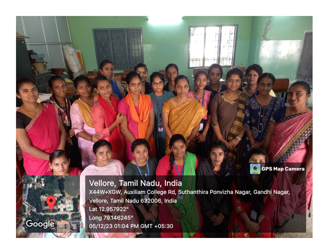
Students participating in the workshop